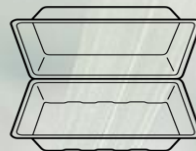
Expanded Polystyrene Food & Drink Containers