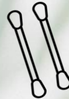
Plastic Cotton Buds